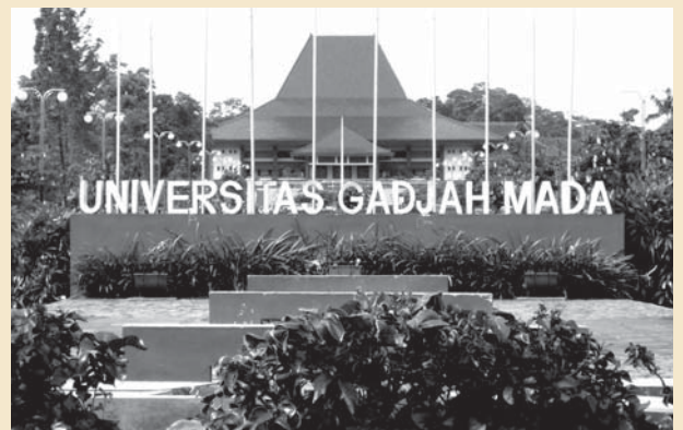
Universitas Gadjah Mada

ジョグジャカルタ・サブセンターでは、2009年2月に「Socio-cultural Networking」をテーマに第7回ジョグジャカルタ・アカデミックフォーラムを開催した。次回(第8回)は2010年2月開催予定で、「To Solve Social Problem through Arts and Cultural Activities」をテーマとすることが決定された。その他、今後、大学生らによる都市文化研究に関する総合的なセミナーや、大学院生による都市文化研究論文コンテストの開催とその優勝者のアカデミックフォーラムでの発表、ウェブの再構築やURPセミナー報告のウェブジャーナルとしての掲載を行いたいと考えている。