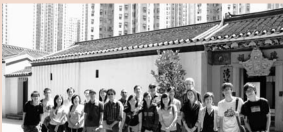
a group photo of all the participants

The Hong Kong Sub-Center co-sponsored an international workshop organised by the Department of Geography, Hong Kong Baptist University, on "Urban Redevelopment in East Asian Cities: The People's Approach", held on 7-9 May in Hong Kong. Urban redevelopment activities are found everywhere in cities in East Asia nowadays. It is, however, the commonplace that this development process has led to the displacement of population, demolition of older buildings, some with high historical values, and the obliteration of more tranquil and lively neighbourhoods to yield vacant land for redevelopment. In general, the public, and the poor in particular, have been worst hit by redevelopment. This workshop broadly applied a framework that invokes Lefebvre, Gramsci, Foucault, Harvey and Allens to comprehend how urban hegemony is achieved in urban redevelopment projects and assess the possibility of counter-hegemonic construction. Hong Kong, Tokyo, Singapore, Taipei and Seoul were included as case studies for elaboration. At the end, it was concluded that given the cruel reality, alternatives for the people are still there. Given its significance, the workshop was well attended by around 80 participants, local and abroad (including the US, Finland, South Korea, Taiwan) alike, even though it was mildly disturbed by the outbreak of Influenza A H1N1. << Wing-Shing TANG