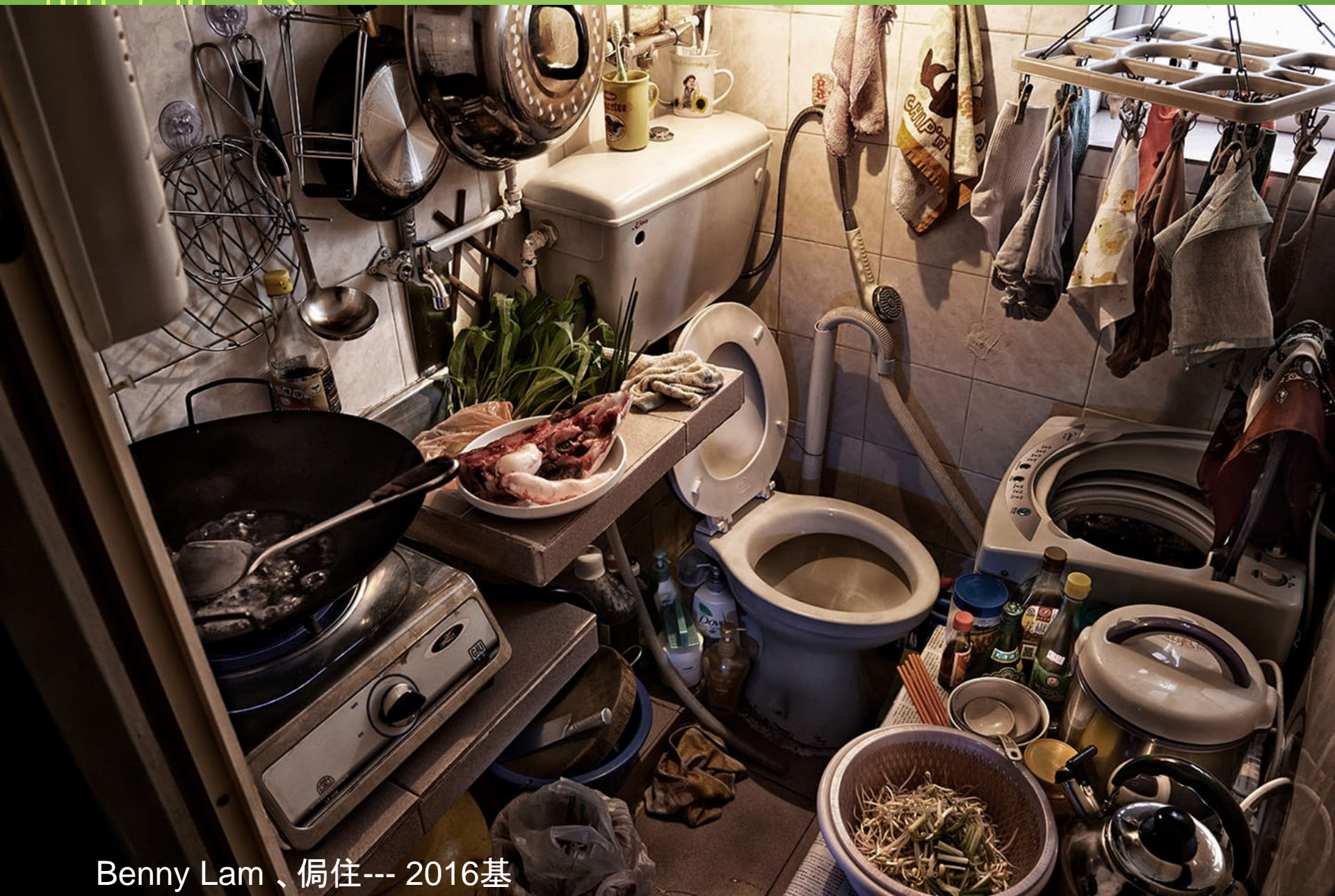
Benny Lam、侷住--- 2016基 層房屋攝影展Trapped