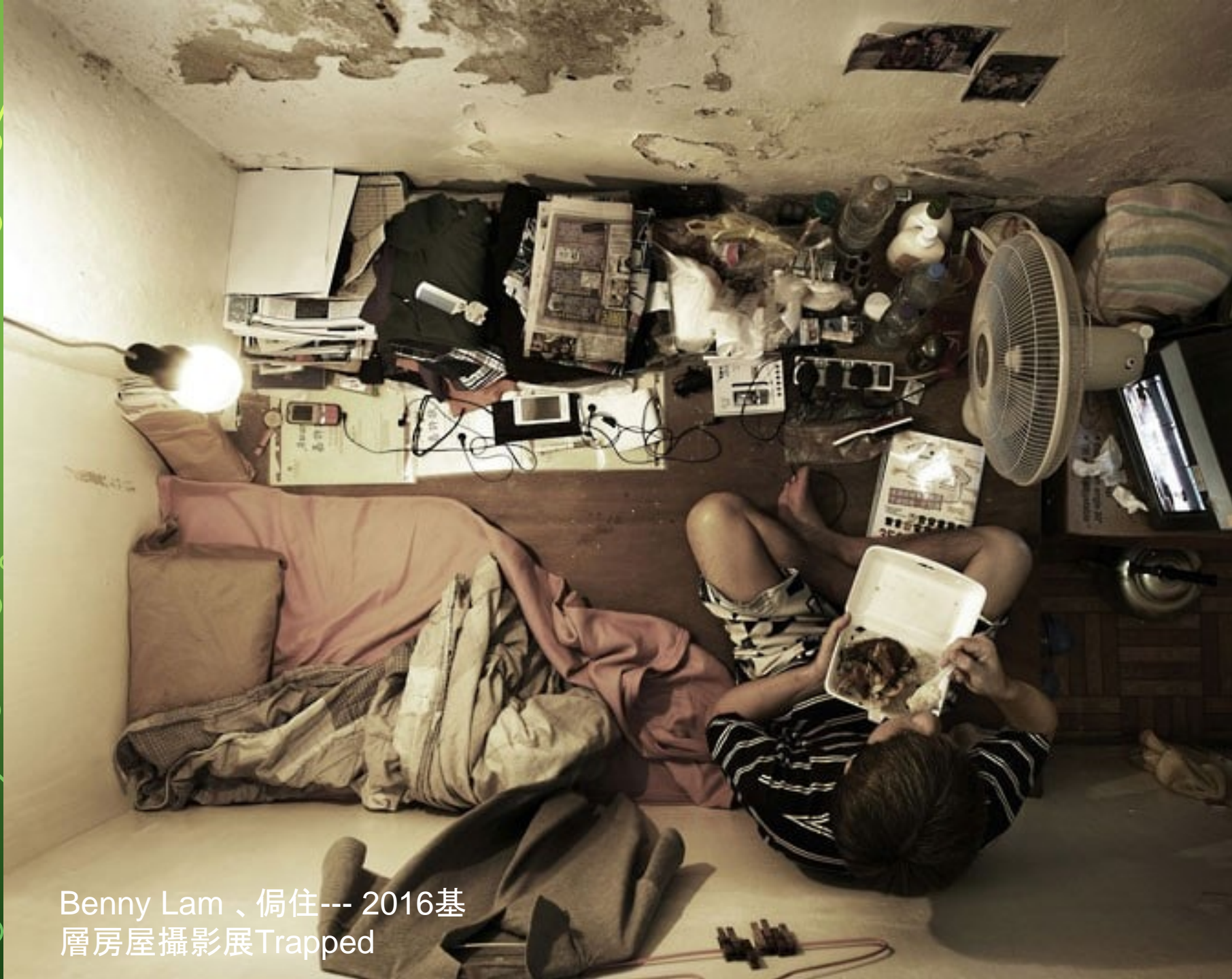
Benny Lam、侷住--- 2016基 層房屋攝影展Trapped