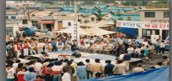
Bokum Dano Festival(1981)