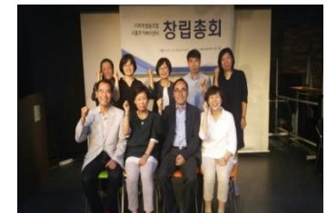
First general meeting in cooperative