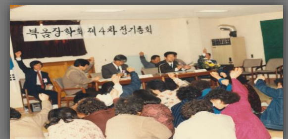
Bokum Scholarship Committee (1983)