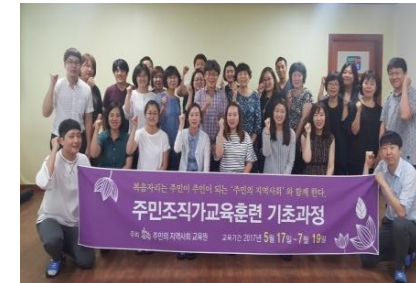
Community Institute of resident