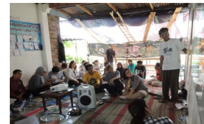
Training for resident leader (organizer) with community