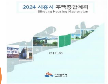
Siheung-si Housing Comprehensive Plan