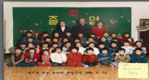
Bokum Preschool·Day- Care