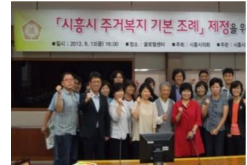
Debate for legislate Welfare Housing Act