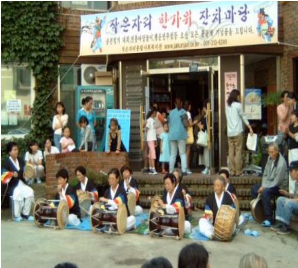
The place based on community - Jakeunjari Hall