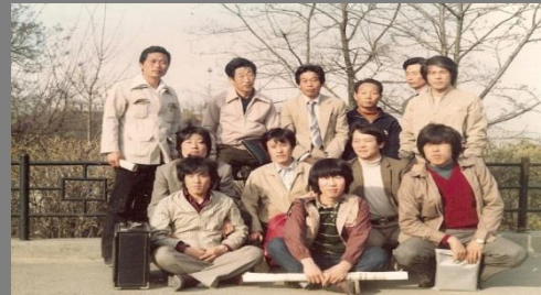
Bokum Credit Union(1978)