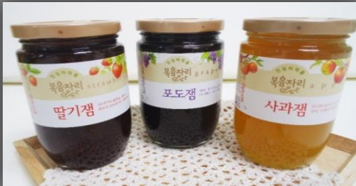
Economic Community (Cooperative)